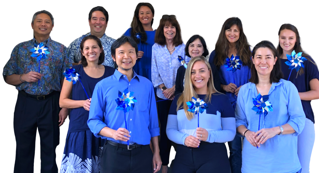
Friends of the Children's Justice Center of Oahu Board of Directors and Staff, 2020